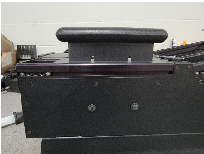
Slide armrest through top of Armrest console plate and determine height.