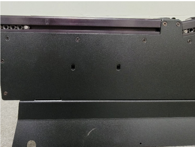
Line up with holes in side of console. Some consoles may not have holes pre-drilled. Drilling holes may be required.