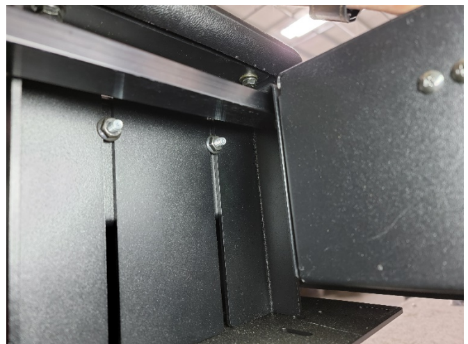
Tighten \frac{1}{4} " serrated nuts to lock height. Install is now complete.