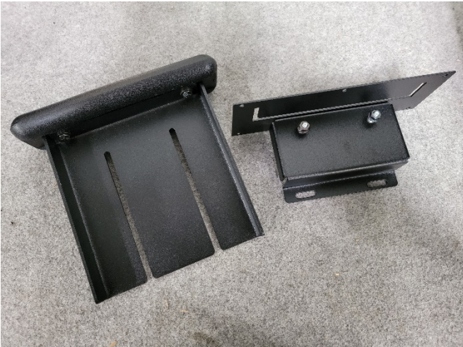
View of C-ARM-110 prior to install