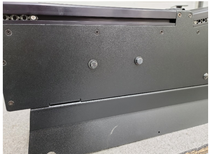
Install \frac{1}{4} " x \frac{3}{4} " hex head bolts, washers and serrated nuts.