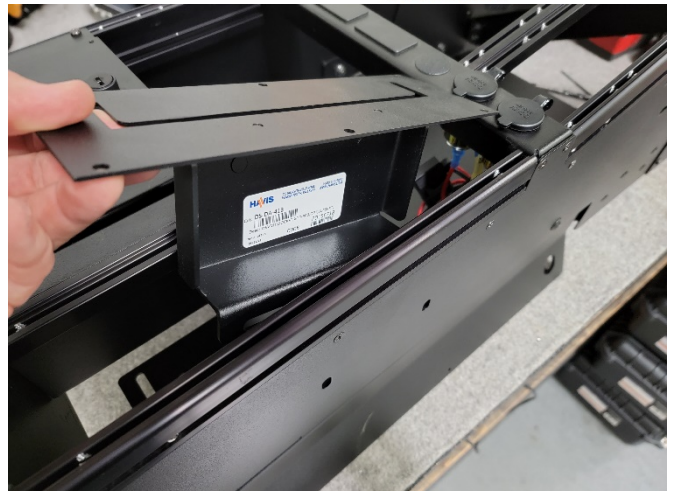
Place Armrest console plate into rear, 3.3" section of console housing.