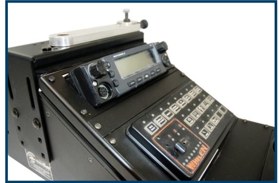
Part # C-EB30-MMT-1P-A shown