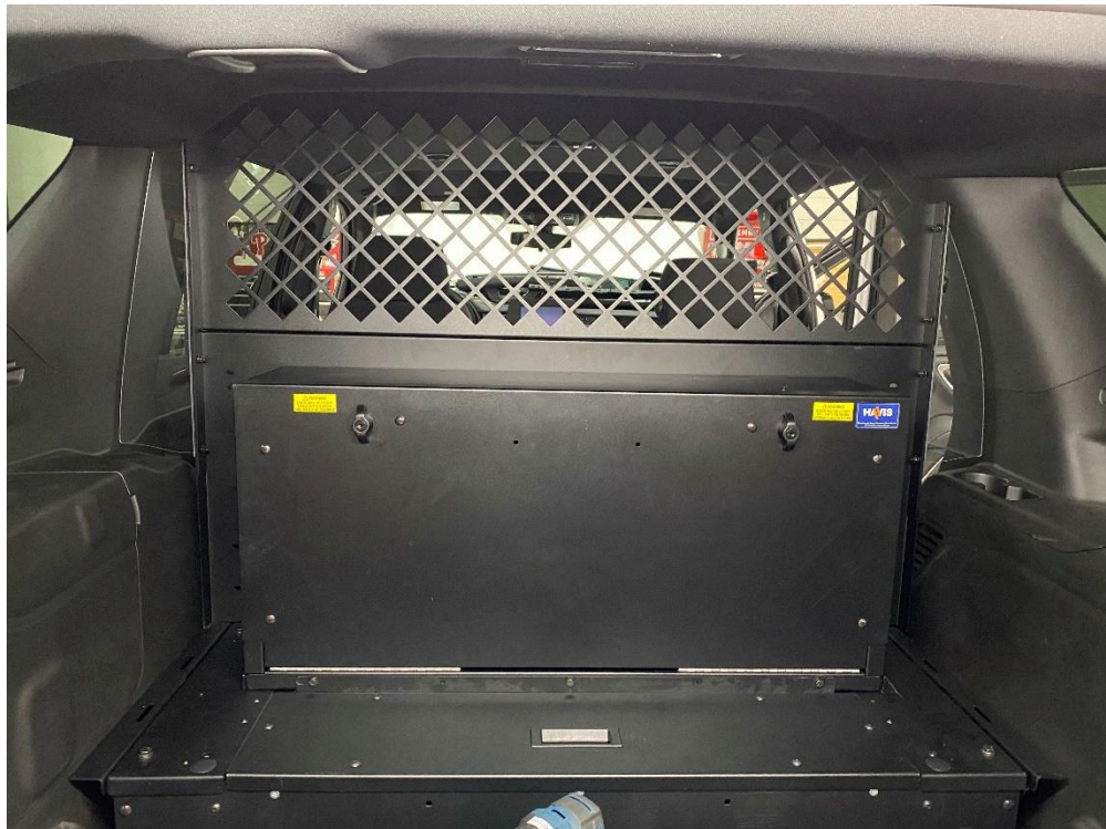
CBR-TAH-1 with C-TTP-TAH-103 and C-SBX-101 Installation complete.